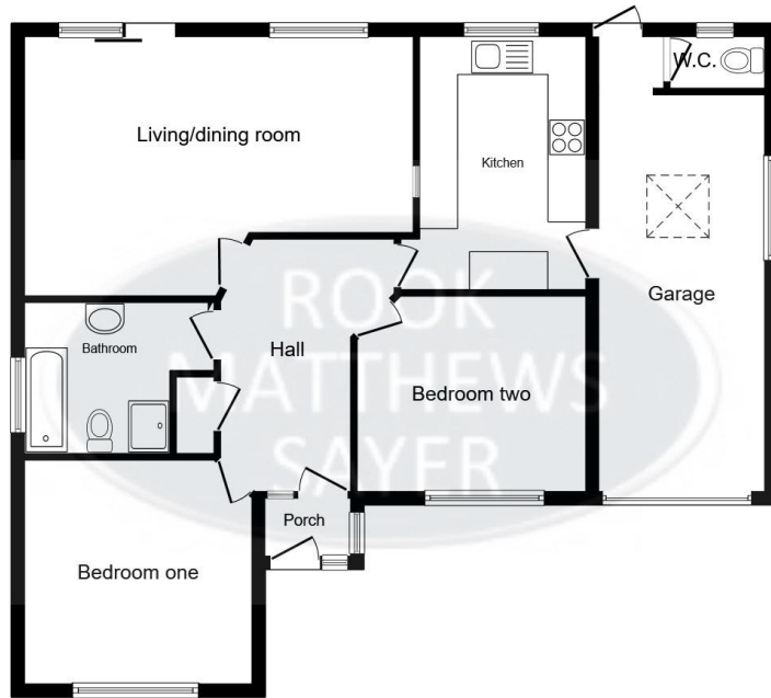
Floor Plan Floor area 96.7 sq.m. (1,041 sq.ft.)

8 Ryelea, Longhoughton, Alnwick, NE66 3DE