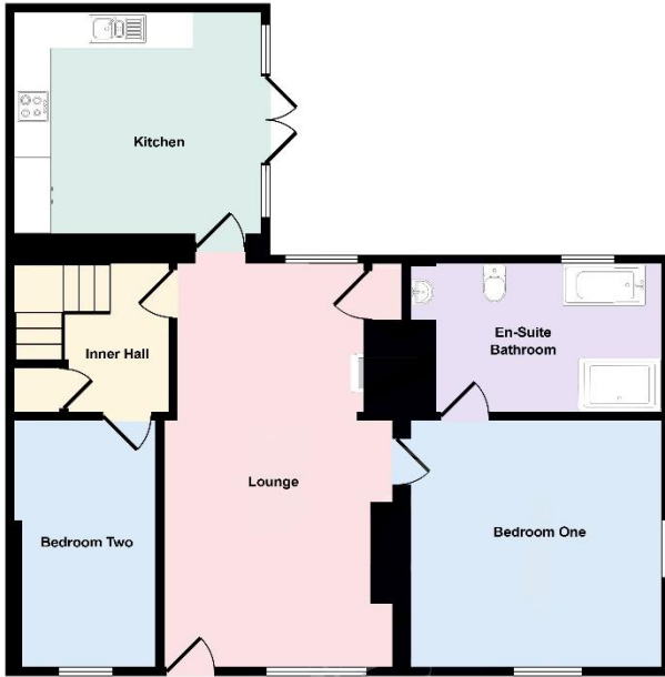
Ground Floor Approx 88 sq m / 946 sq ft

Approx Gross Internal Area 147 sq m / 1581 sq ft