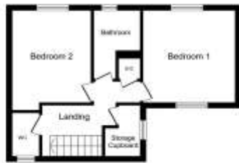
First Floor Floor area 29.5 sq.m. (425 sq.ft.)

Total floor area: 67.4 sq.m. (941 sq.ft.)