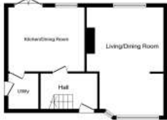
Ground Floor Floor area 47.9 sq.m. (514 sq.ft.)