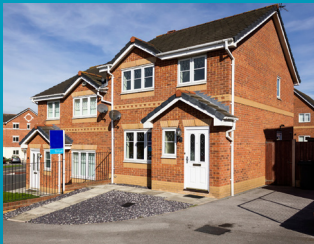
PREPARING THE EXTERIOR

Home staging is the process of cleaning, tidying and de-cluttering a property in preparation for professional photos. Homes that are clean, tidy and clutter-free achieve the best photos, attract more attention and achieve the best possible price.