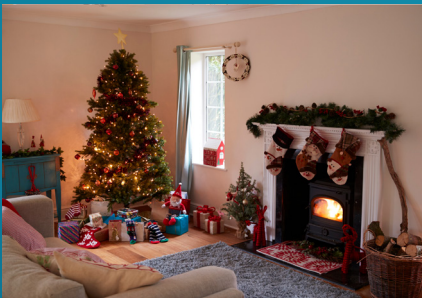
HOME STAGING AT CHRISTMAS, HALLOWEEN, EASTER & BIRTHDAYS

To avoid time-stamping photos, please ensure seasonal decorations are kept down for the photo shoot. If we do capture decorations in photos, unfortunately we might not be able to remove them during the enhancement process.