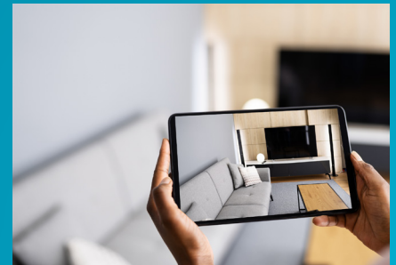
FOR OUR 360° CONTENT CUSTOMERS

Unfurnished or empty properties require the same home staging treatment as furnished or occupied homes. Please ensure the property is clean, tidy and clutter free to achieve the best results.