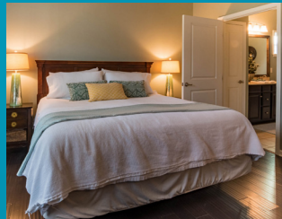
PREPARING RECEPTION ROOMS & BEDROOMS