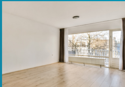
WHAT IF THE PROPERTY IS EMPTY?

To avoid time-stamping photos, please ensure seasonal decorations are kept down for the photo shoot. If we do capture decorations in photos, unfortunately we might not be able to remove them during the enhancement process.