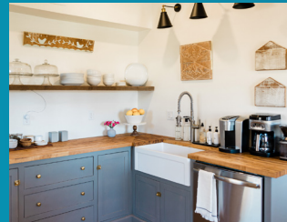
PREPARING THE KITCHEN