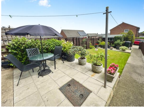
EPC WILL GO HERE

Important Note: Rook Matthews Sayer (RMS) for themselves and for the vendors or lessors of this property, whose agents they are, give notice that these particulars are produced in good faith, are set out as a general guide only and do not constitute part or all of an offer or contract. The measurements indicated are supplied for guidance only and as such must be considered incorrect. Potential buyers are advised to recheck the measurements before committing to any expense. RMS has not tested any apparatus, equipment, fixtures, fittings or services and it is the buyer's interests to check the working condition of any appliances. RMS has not sought to verify the legal title of the property and the buyers must obtain verification from their solicitor. No persons in the employment of RMS has any authority to make or give any representation or warranty whatever in relation to this property.