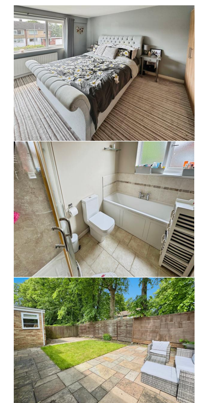
EPC WILL GO HERE

Important Note: Rook Matthews Sayer (RMS) for themselves and for the vendors or lessors of this property, whose agents they are, give notice that these particulars are produced in good faith, are set out as a general guide only and do not constitute part or all of an offer or contract. The measurements indicated are supplied for guidance only and as such must be considered incorrect. Potential buyers are advised to recheck the measurements before committing to any expense. RMS has not tested any apparatus, equipment, fixtures, fittings or services and it is the buyer's interests to check the working condition of any appliances. RMS has not sought to verify the legal title of the property and the buyers must obtain verification from their solicitor. No persons in the employment of RMS has any authority to make or give any representation or warranty whatever in relation to this property.