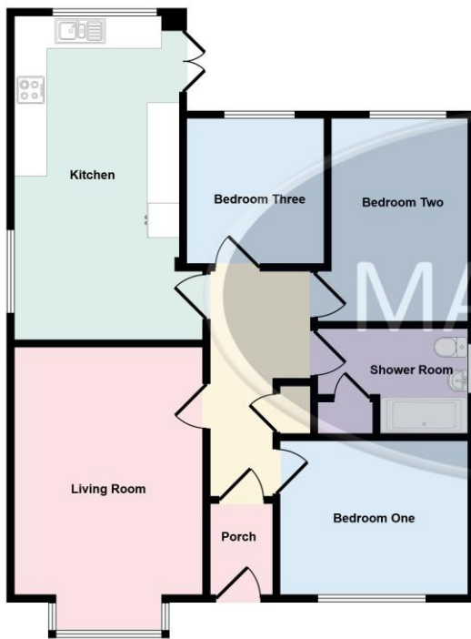
Ground Floor Approx 83 sq m / 898 sq ft

Approx Gross Internal Area 142 sq m / 1527 sq ft