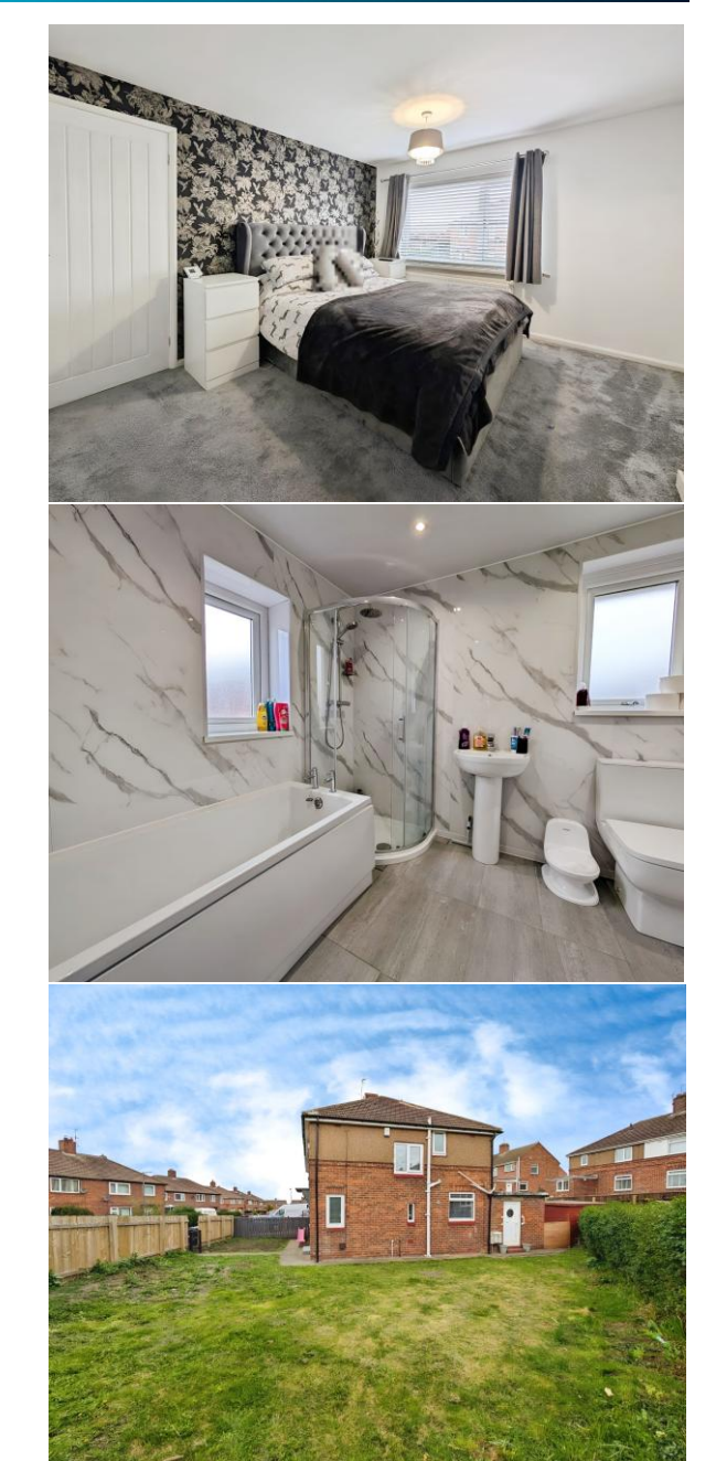
EPC WILL GO HERE

Important Note: Rook Matthews Sayer (RMS) for themselves and for the vendors or lessors of this property, whose agents they are, give notice that these particulars are produced in good faith, are set out as a general guide only and do not constitute part or all of an offer or contract. The measurements indicated are supplied for guidance only and as such must be considered incorrect. Potential buyers are advised to recheck the measurements before committing to any expense. RMS has not tested any apparatus, equipment, fixtures, fittings or services and it is the buyer's interests to check the working condition of any appliances. RMS has not sought to verify the legal title of the property and the buyers must obtain verification from their solicitor. No persons in the employment of RMS has any authority to make or give any representation or warranty whatever in relation to this property.