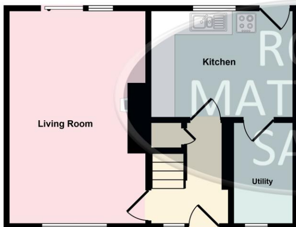
Ground Floor Approx 39 sq m / 425 sq ft

Approx Gross Internal Area 79 sq m / 850 sq ft